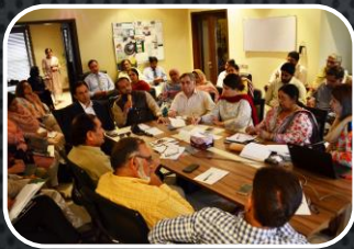
Policy & Strategy Development