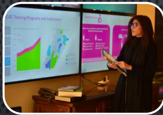
Human Resource Planning