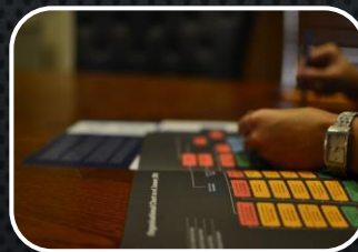
Communication and Reporting