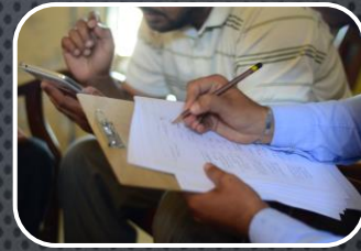
Monitoring & Evaluation